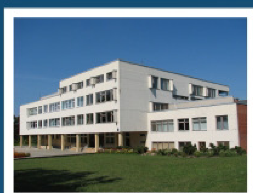
MALPILS SECONDARY SCHOOL