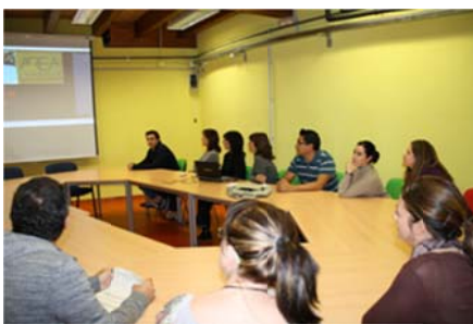
Spanish people participating through the streaming connection