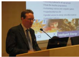
Project Officer giving his welcome speech