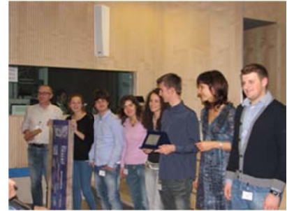
Italian winners with their professors