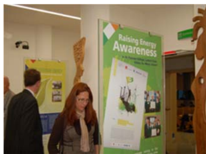
People looking at the posters