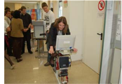
A girl trying the energy efficient bike