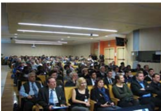
Project partners in the first line