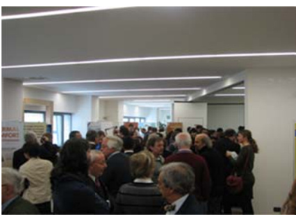
People interacting during the Live Session