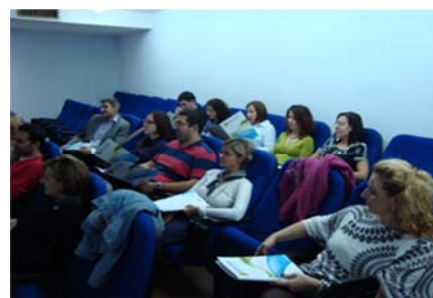
Greek people participating through the streaming connection