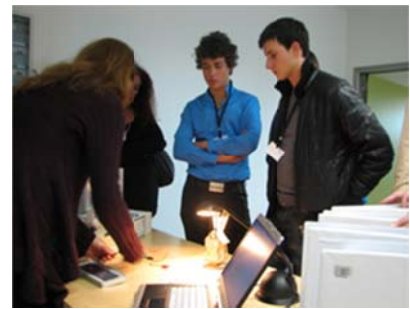
Students watching the experimental toolkit