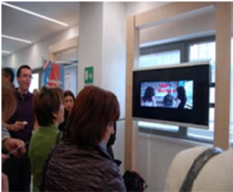
People watching EESA videos

The Live Session was a great success, the posters were really appreciated and the partners received many requests of information about the EESA projects. It was an occasion for interacting, creating new contacts and exchange considerations on the IUSES project, on different teaching methodologies and on the opportunities that IUSES can bring for the future. It represented an opportunity for all participants: for teachers who had the occasion of interact with colleagues from other countries, to talk with educational authorities without intermediaries, but also for students who enjoyed watching the videos, the experimental toolkit or the bike measuring energy efficiency produced by cycling presented by Slovenian participants.