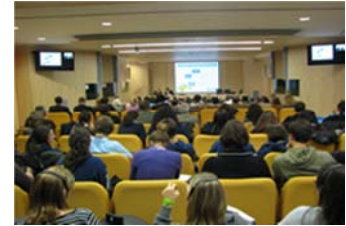
Students listening to the interventions