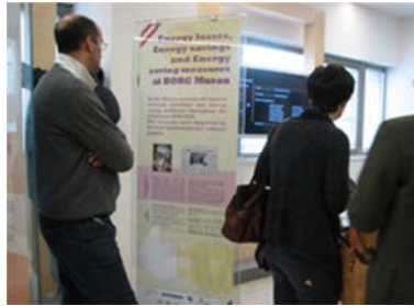
People looking at the posters