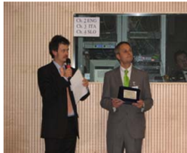
A Spanish winner with the project coordinator